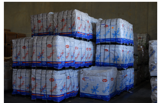
BarChip pallets can be safely stacked 3 pallets high

Every workplace is different and there's no one size fits all approach. Teach people proper operational techniques based on your workplace and your health and safety guideline.